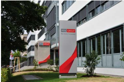
In the heart of the TechnologyRegion Karlsruhe: The PTV Headquarters.