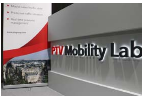
The new mobility lab of PTV Group, Karlsruhe is a worldwide unique laboratory for the testing of future mobility scenarios.