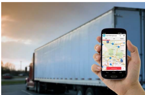
The Truck Parking Europe application gives access to the largest European platform for truck parking.