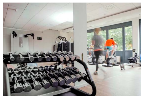
In the company's gym, PTV employees stay in motion.