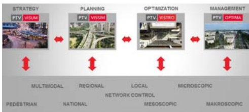
The value chain in transport planning.

The mind of movement: The PTV Group offers smart software for the future of mobility.