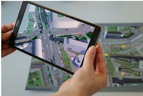
Based on a unique expertise in every facet of mobility, PTV supports smooth traffic flow.