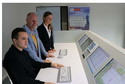
New mobility approaches are tested using historic and online data.