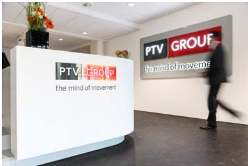
The mind of movement: PTV Group supports decision-makers and users in taking the right steps for the future.