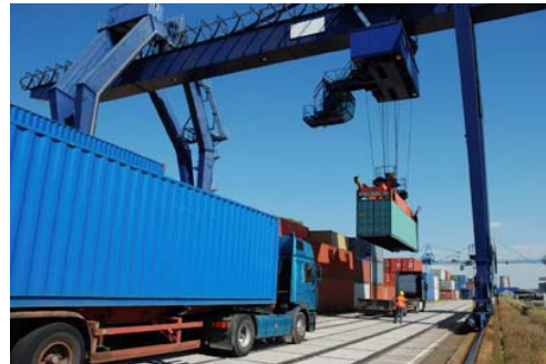
PTV improves mobility and transport - by using world-class software, data and scientific know-how.