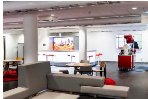
The PTV community meets and exchanges at the PTV campus