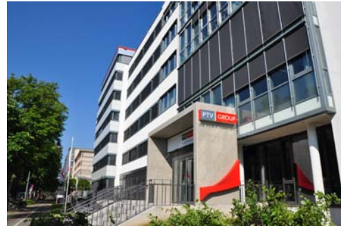
The headquarters in Karlsruhe is the centre of innovation and development.