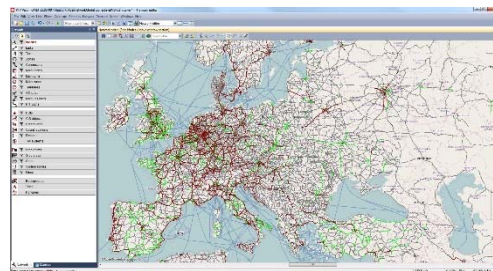
PTV software is used to develop the pan-European transport model for the EU Commission.