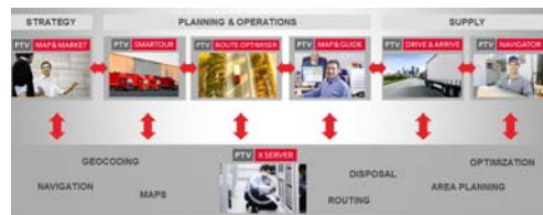
The value chain in logistics.