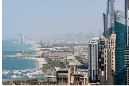
PTV Group foresees a huge potential for mobility solutions in Middle East, Africa and India.